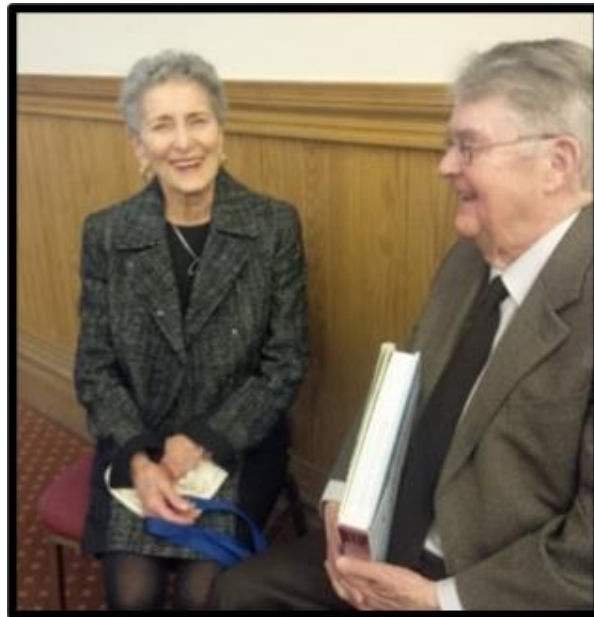
Natalie Zemon Davis and James K. McConica

A Conference in Memory of Natalie Zemon Davis and James K. McConica on the Sixtieth Anniversary of the Founding of the Colloquium